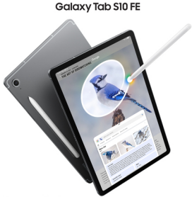
Cerca e cerca con Google